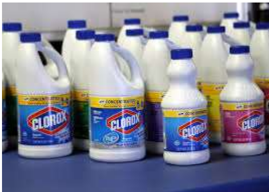
Sodium Hypochlorite Cat. 4 Class 1 DG Exempt quantity: 250 litres