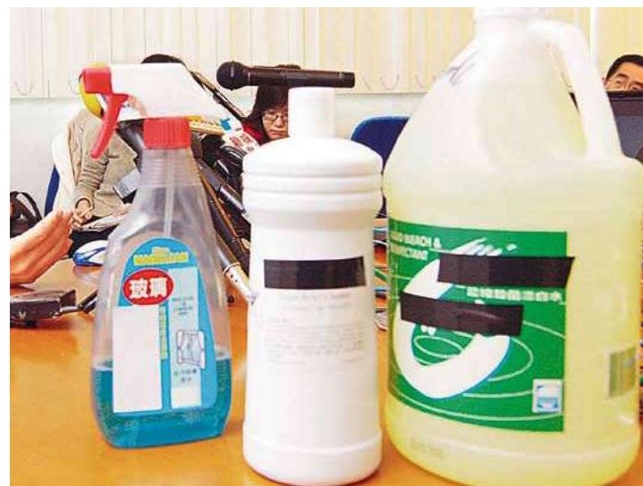
Hydrogen Peroxide Cat. 7 DG Exempt quantity: 25 litres