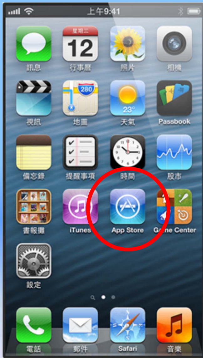
App Store – “consultation”